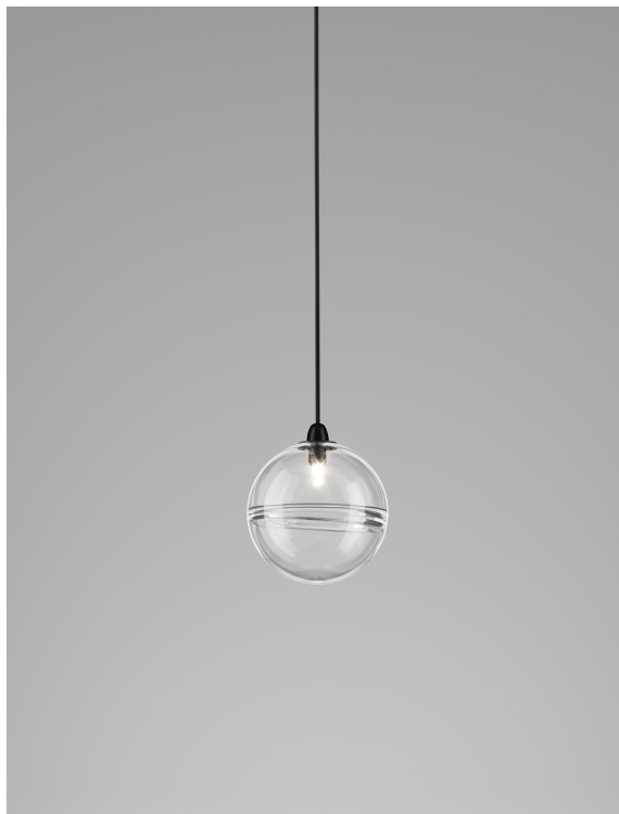
ORO SP P CRTR NN G9 CE